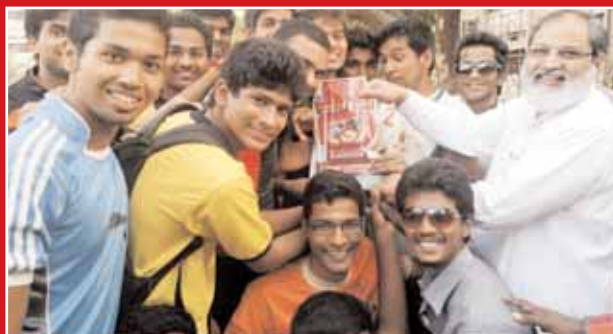
Congratulations!!! WINNER Zonal Tournament 2011-12 Vidyalankar Polytechnic Kabaddi Team