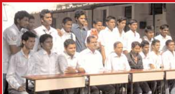
Congratulations!!! WINNER Zonal Tournament 2011-12 Vidyalankar Polytechnic Football Team