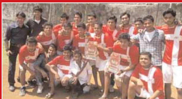
Congratulations!!! RUNNER UP Inter Zonal Tournament 2011-12 Vidyalankar Polytechnic Football Team