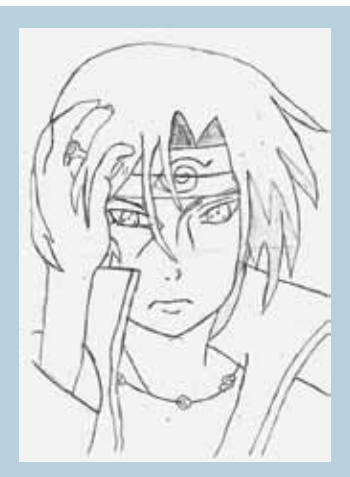
Sketch by Aniket Kulkarni,